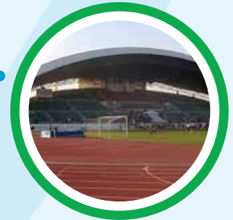
Dubai Police Officers Club