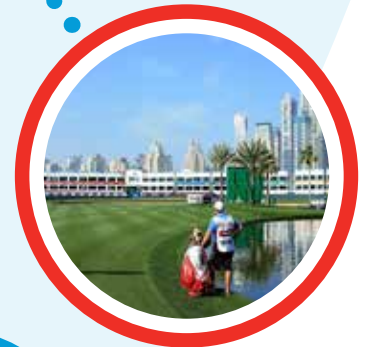
Emirates Golf Club